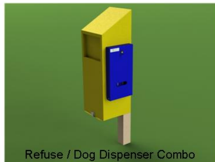
Refuse / Dog Dispenser Combo

Direct Shipping Available No Minimum Order Quantities