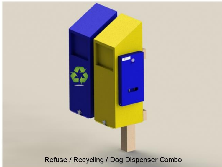
Refuse / Recycling / Dog Dispenser Combo