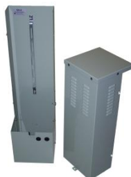
CP104 with V-Brkt Removable Lid