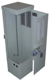
CP104D with Amp-rod Single Door