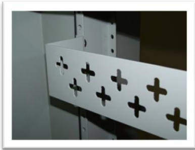
Universal Mounting Plate

The CP Pedestal Series is designed for CATV distribution equipment. Designed specifically to better withstand environmental conditions, Inventronics' specialized CORR II process ensures that each enclosure is durably constructed and finished with an exceptional quality polyester powder coating. With room for taps, couplers, splitters, line extenders and amplifiers the CP Pedestal Series is a must have for your OSP Network. A variety of universal mounting brackets, amp-rods, stake kits and colors are available.